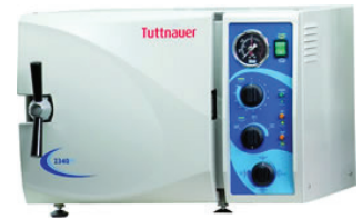
Classic Series 2340M & 2540M