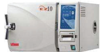
EZ9 & EZ10