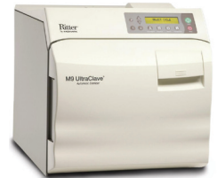
M9 & M11