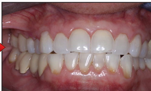
(2) 5 year results after PST *Per the suture-free method taught at the seminar