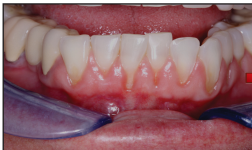
(1) Before PST, full lower arch March 2011 Scalpel-free, *Suture-free