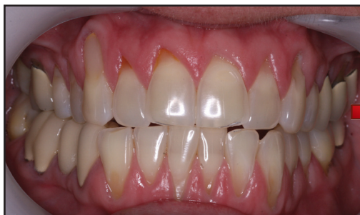
(1) Before PST, on full upper arch December 2009, removed 7mm restoration on tooth #6 Scalpel-free, *Suture-free

Chao J. Int J Periodontics Restorative Dent 2012; 32: 521-531