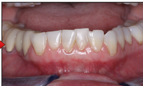
(2) 3 year results after PST *Per the suture-free method taught at the seminar