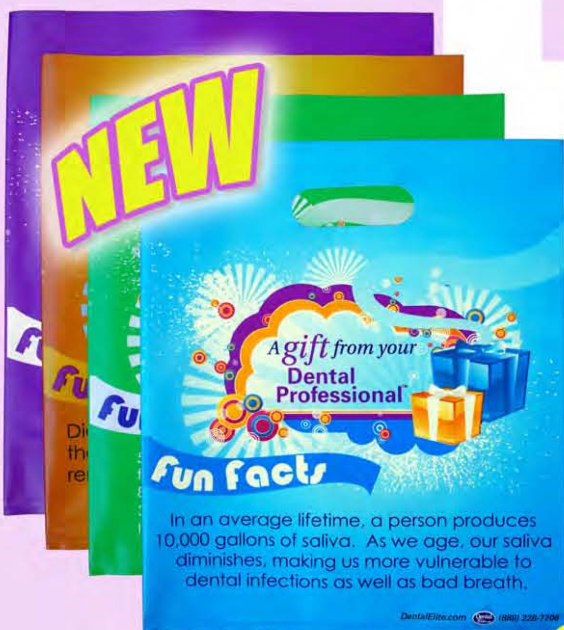
NEW Educational Bag - Comes in 4 colors, 36 of each color. Educational Facts on one side, Fun Facts on the other.