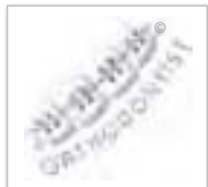
AD-57 Options: Silver / Copper