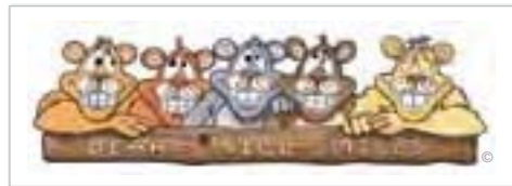
AD-67 Options: With/No Braces