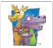
AD-20 Options: With/No Braces