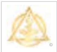
AD-95 Options: With/No Braces Vertical ONLY