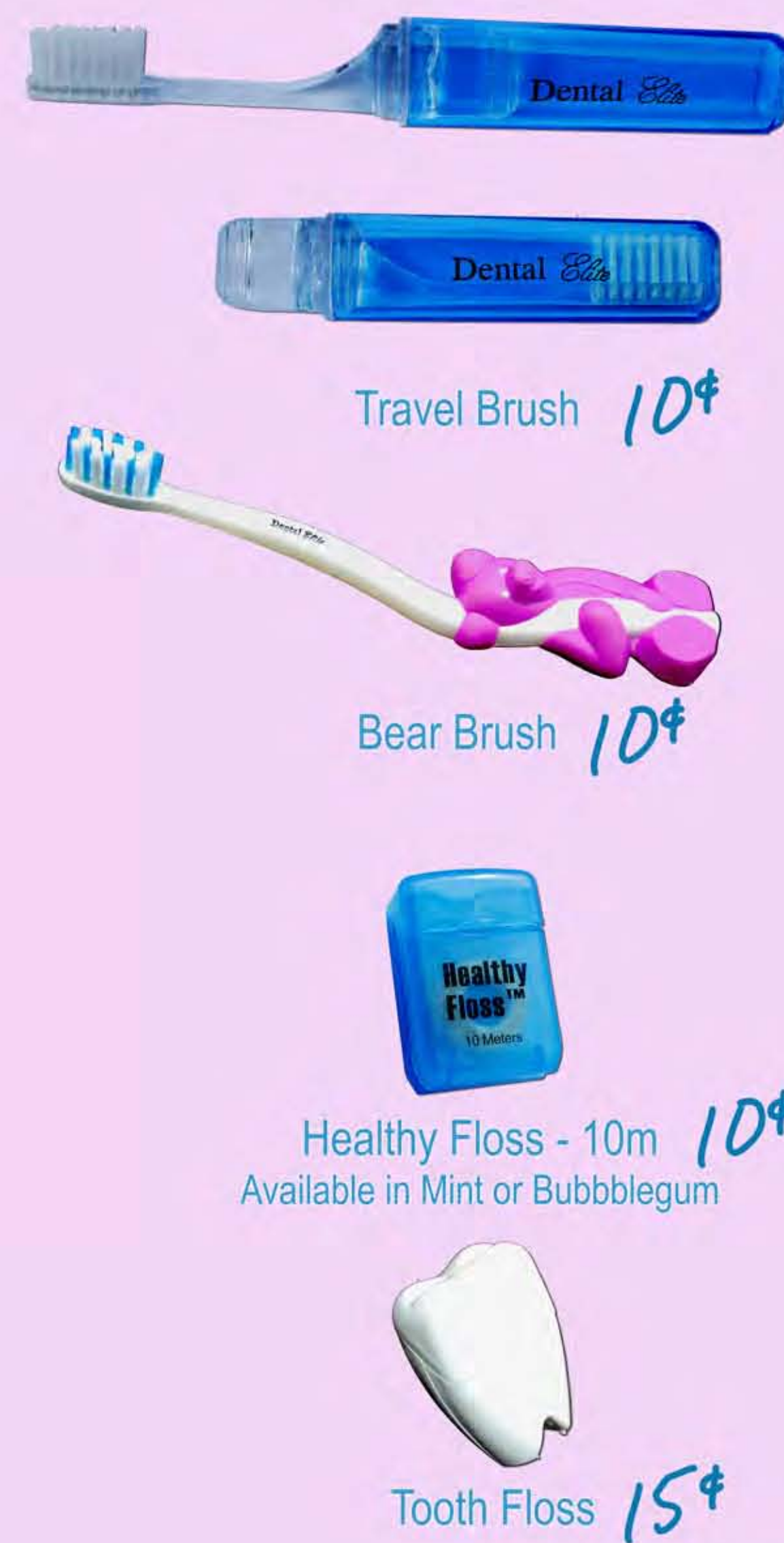
Travel Brush 10¢

Modify your Kit offerings with the items below. *See below Substitute Items menu