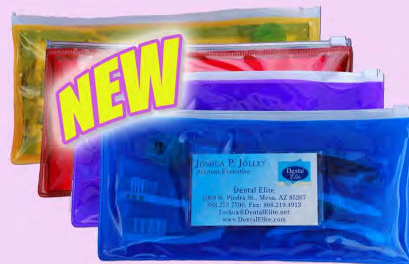
NEW Pouches - 10¢ Comes in 4 colors, 36 of each color