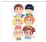
AD-71 Options: With/No Braces