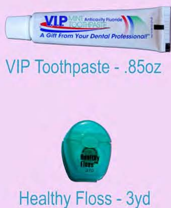
VIP Toothpaste - .85oz