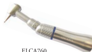
ELCA760 Push Button Latch