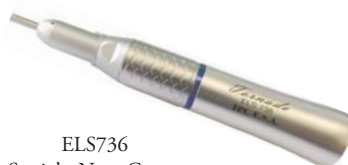
ELS736 Straight Nose Cone