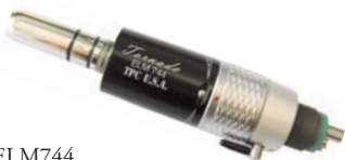
ELM744 Slow Speed Motor