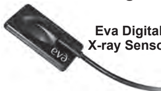
Eva Digital X-ray Sensor