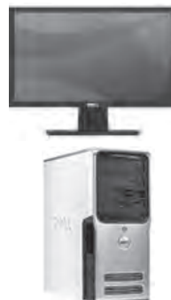
Dell Computer (Win 7) & Monitor