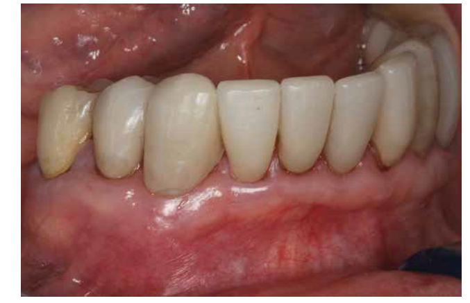
(2) After completion of PST on full lower arch. This photo-May 2014, 5 years later. *(Scalpel-free, Suture-free, Graft-free)

(1) Joyce: Before PST, full lower arch, May 2009.