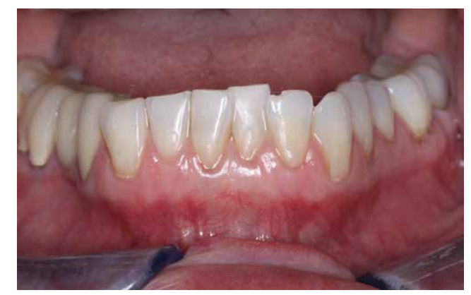
(4) After completion of PST on full lower arch. (This photo 3+ years later May 2014) keratinized tissue regenerated. *(Scalpel-free, Suture-free, Graft-free)

(2) After completion of PST on full upper arch. (This photo 5+ years later May 2014). *(Scalpel-free, Suture-free, Graft-free)