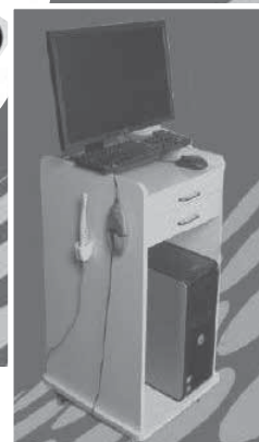
Dell Computer, Monitor & Cart