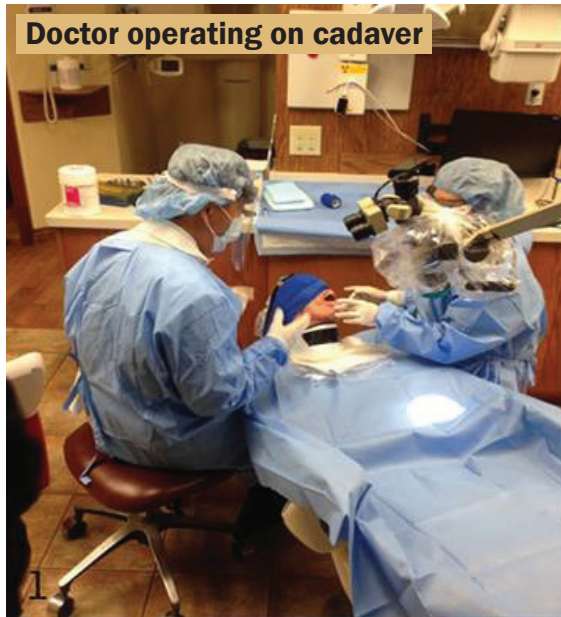
Doctor operating on cadaver