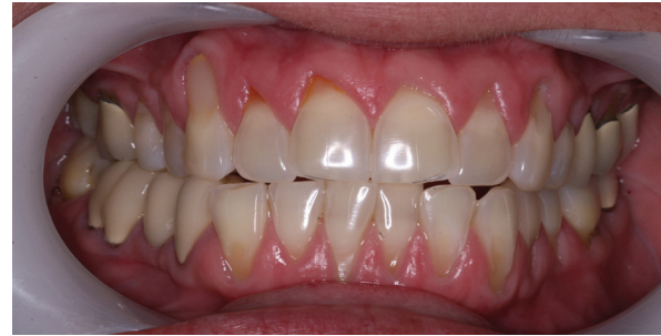
(1) Sharon: Before PST, on full upper arch (December 2009, removed 7mm restoration on tooth #6).