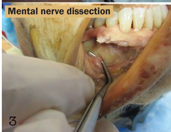
Mental nerve dissection