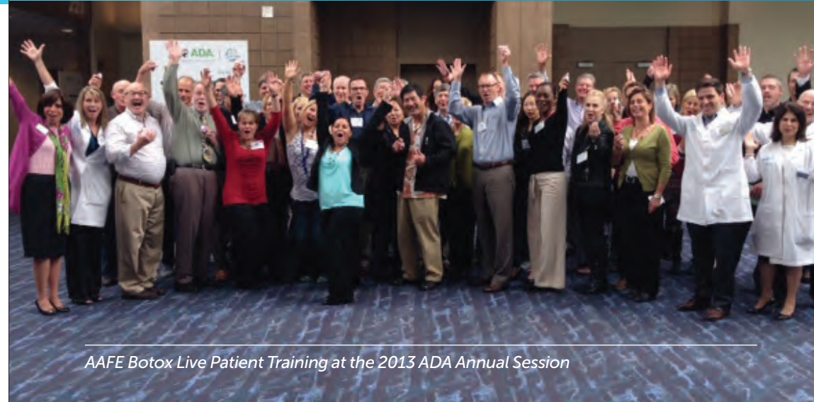
AAFE Botox Live Patient Training at the 2013 ADA Annual Session