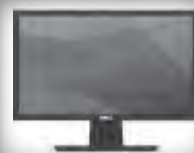
Dell Computer (Win 7) & Monitor