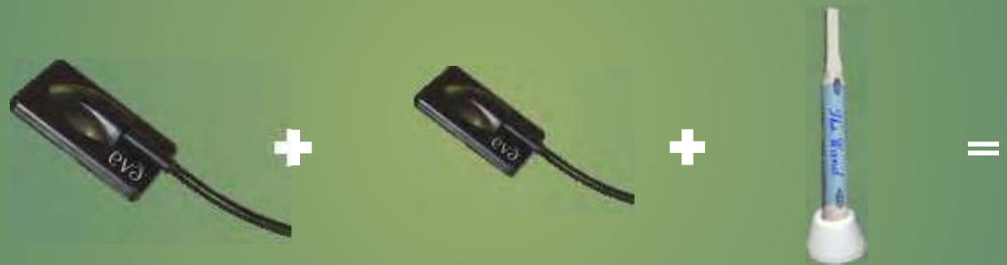
EVA #2 SENSOR