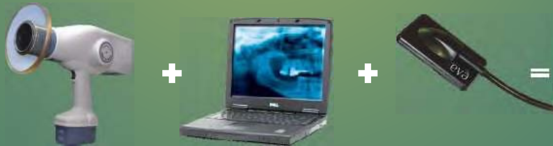
ARIBA X-RAY UNIT