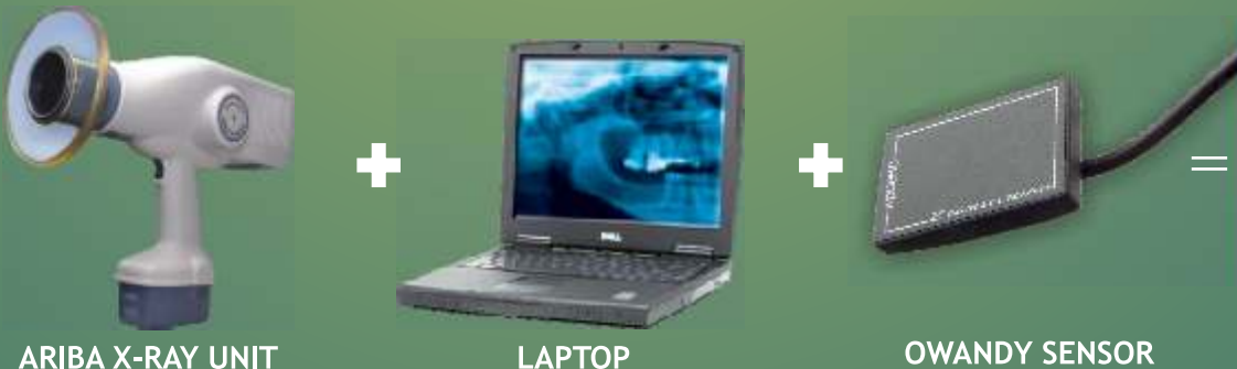
ARIBA X-RAY UNIT