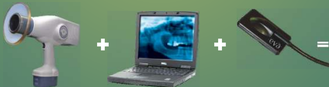
ARIBA X-RAY UNIT