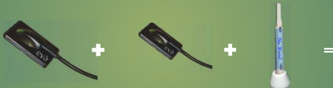
EVA #2 SENSOR