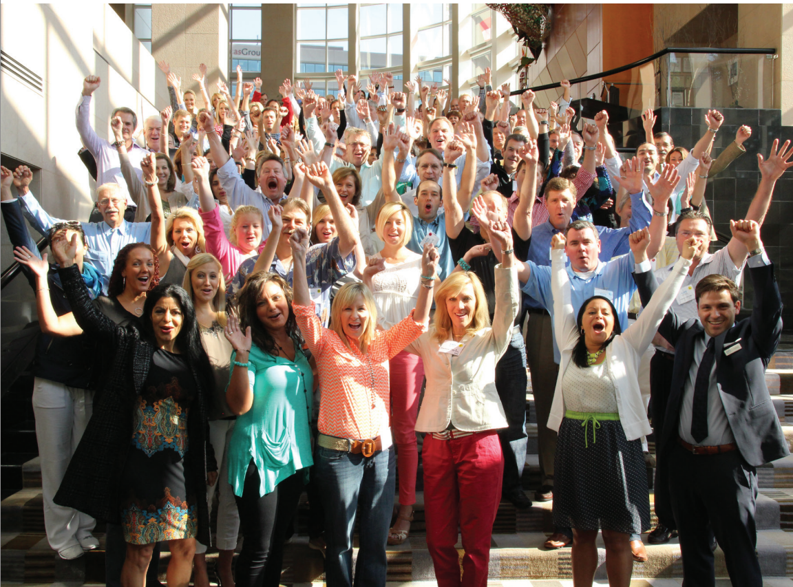
AAFE Level 1 Course, Atlanta, GA

AAFE courses provide training equal to and often exceeding the education taught in academic communities around the world over the last 5 decades.