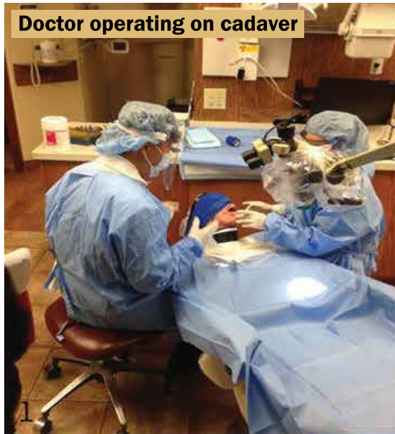
Doctor operating on cadaver