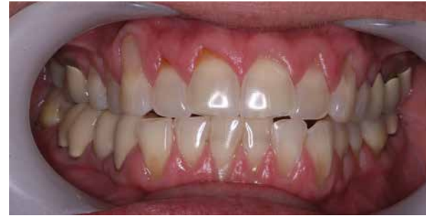
(1) Sharon: Before PST, on full upper arch (December 2009, removed 7mm restoration on tooth #6).