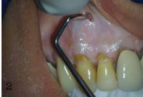
Mental nerve dissection