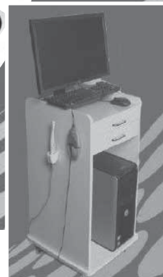
Dell Computer, Monitor & Cart