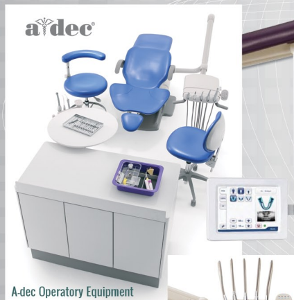
A-dec Operatory Equipment

Southern California's Premier Equipment Dealer (800) 376-8582 · (805) 532-1870