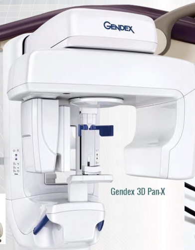
Gendex 3D Pan-X