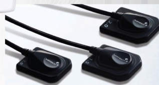
Vatech I/O Sensors

There's still time for big tax savings! Call today!