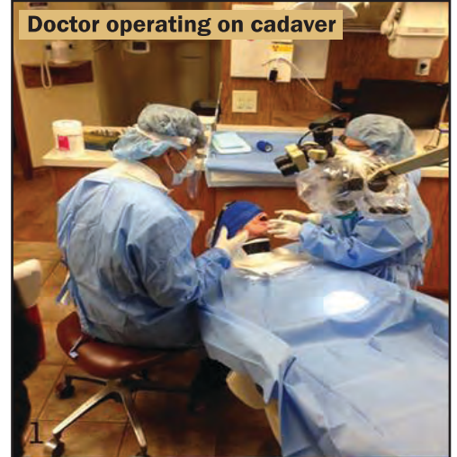
Doctor operating on cadaver