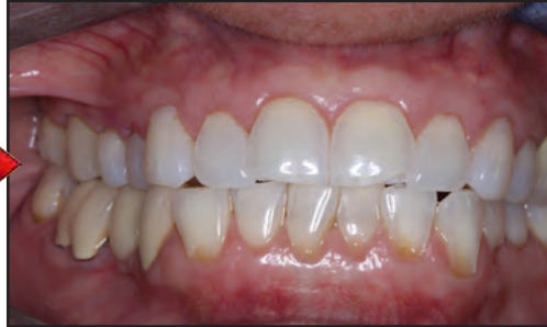
(2) 5 year results after PST *Per the suture-free method taught at the seminar