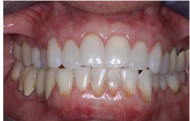
(2) After completion of PST on full upper arch. (This photo 5+ years later May 2014).

* (Scalpel-free, Suture-free, Graft-free)