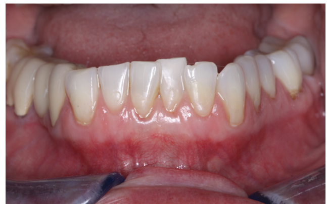
(4) After completion of PST on full lower arch. (This photo 3+ years later May 2014) keratinized tissue regenerated.

* (Scalpel-free, Suture-free, Graft-free)