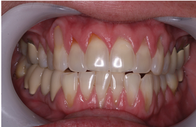
(1) Sharon: Before PST, full upper arch December 2009 removed 7mm restoration on tooth #6.