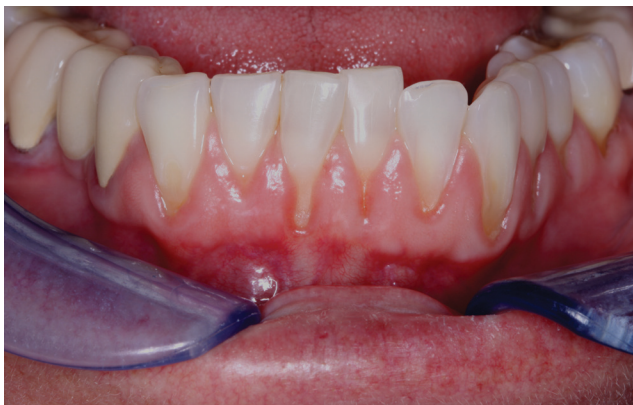
(3) Sharon: Before PST, full lower arch March 2011.

* (Scalpel-free, Suture-free, Graft-free)