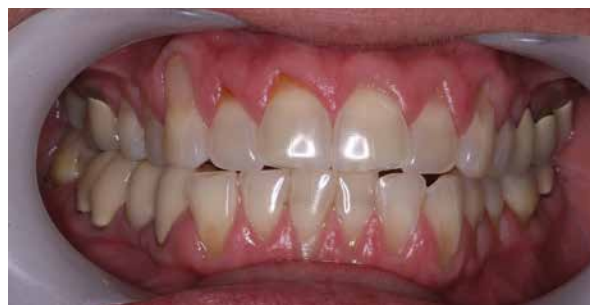
(1) Sharon: Before PST, on full upper arch (December 2009, removed 7mm restoration on tooth #6).