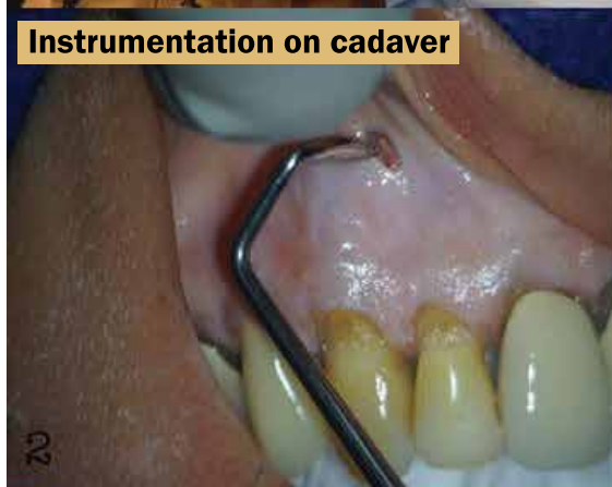
Instrumentation on cadaver