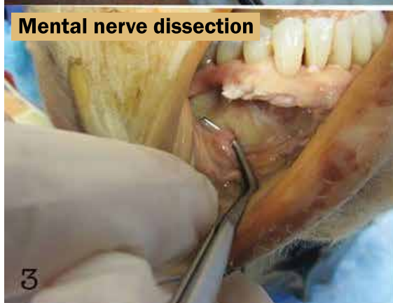
Mental nerve dissection