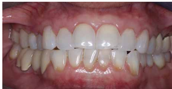
(2) After completion of PST on full upper arch. (This photo 5+ years later May 2014).

*(Scalpel-free, Suture-free, Graft-free)