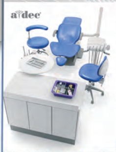
A-dec Operator Equipment