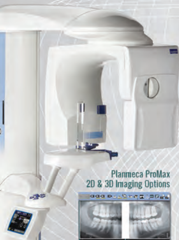
Planmeca ProMax 2D & 3D Imaging Options