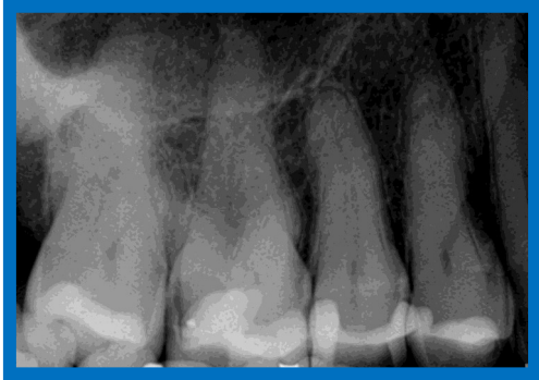
Go From this