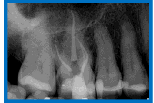
To this in 30 Min

80% of General Dentist perform RCT everyday in their practice. However, many acknowledge they sometimes struggle. Often they simply refer them out. After performing over 1 million RCT procedures our group of 40 Endodontist have discovered a way to massively simplify this process and have successfully trained many General Dentist to do these procedures in 30 min or less.