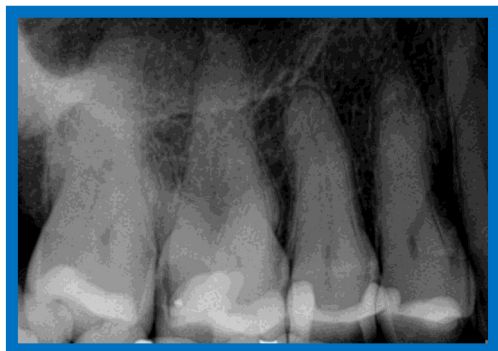
Go From this