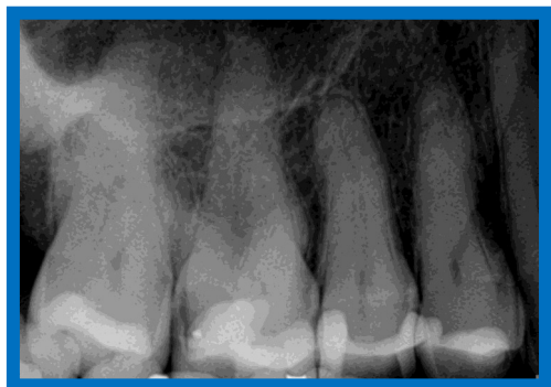
Go From this