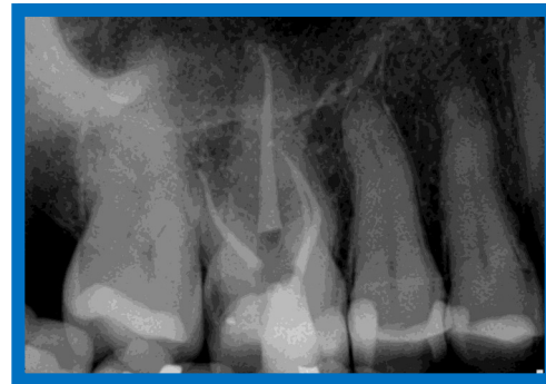
To this in 30 Min

80% of General Dentist perform RCT everyday in their practice. However, many acknowledge they sometimes struggle. Often they simply refer them out. After performing over 1 million RCT procedures our group of 30 Endodontist have discovered a way to massively simplify this process and have successfully trained many General Dentist to do these procedures in 30 min or less.