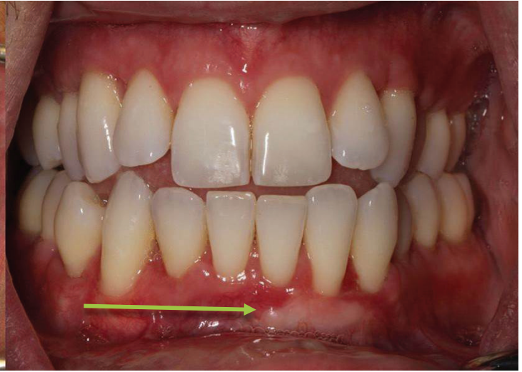
Full lower arch After Pinhole® failed graft moved back up