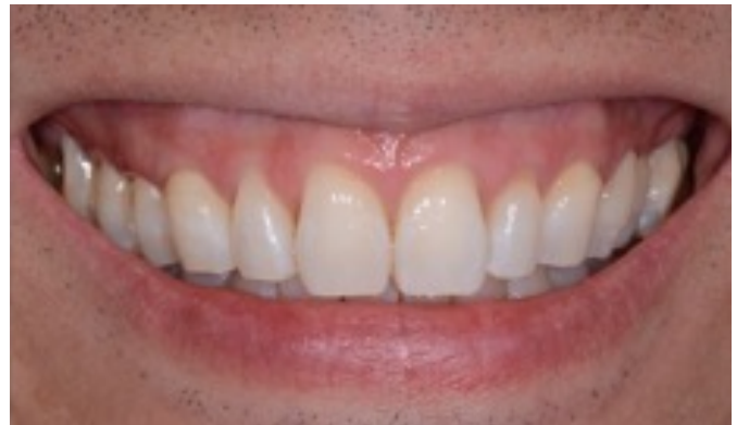
10 years after Pinhole (9-21-2016) Typically 1-3mm pocket depths after Pinhole (No scalples, NO sutures, NO grafts)