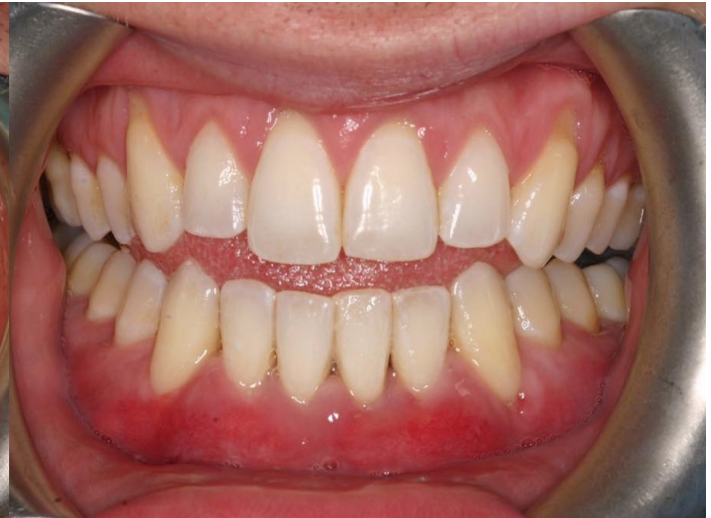
After Pinhole® - difficult lower arch corrected in 1 session