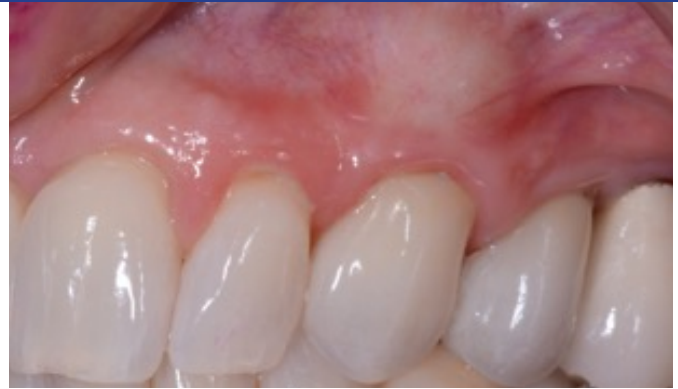
11 years after Pinhole® (11-28-2016) Pinhole is a long-term option with no pseudo pockets (No scalples, NO sutures, NO grafts)