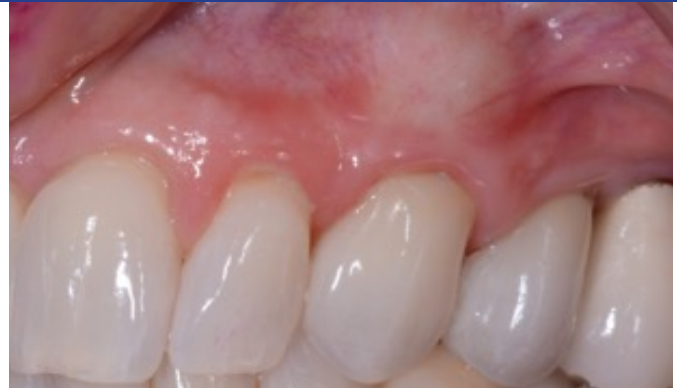
11 years after Pinhole® (11-28-2016) Pinhole is a long-term option with no pseudo pockets (No scalples, NO sutures, NO grafts)