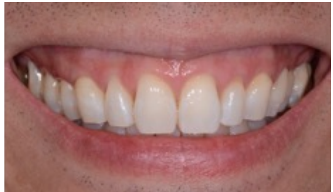
10 years after Pinhole (9-21-2016) Typically 1-3mm pocket depths after Pinhole (No scalples, NO sutures, NO grafts)