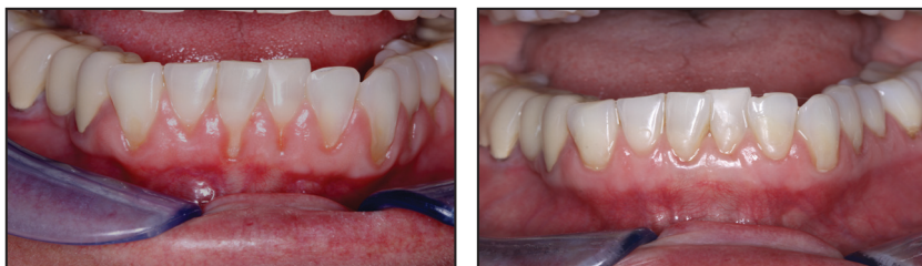
(1) Before Pinhole®, full lower arch March 2011 Scalpel-free, Suture-free, Graft-free

Millions of Pinhole® patients are looking for certified Pinhole dentists!