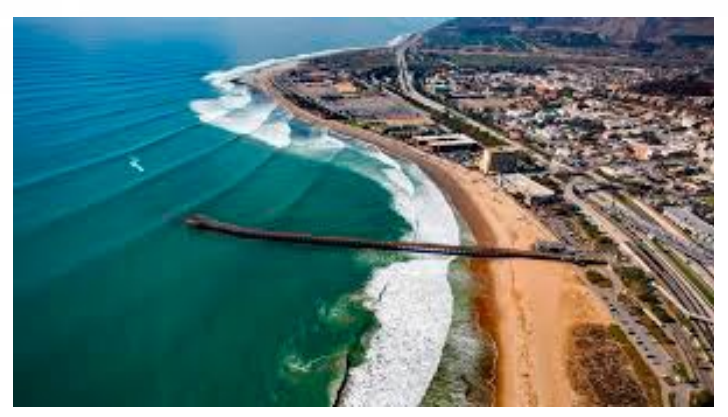
Located in the beautiful city of Ventura by the ocean.