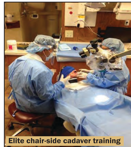
Elite chair-side cadaver training