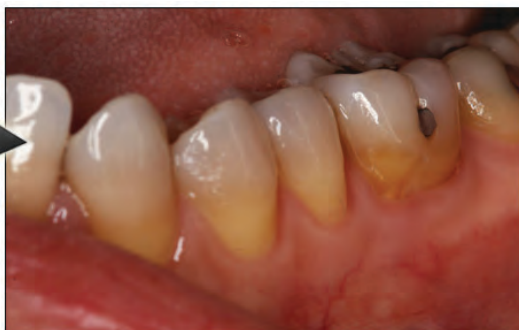
Furcation problem improved after Pinhole®.