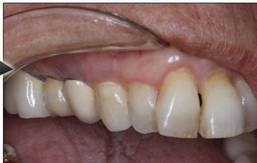
7/11/14 - 7 year results after Pinhole®. *Per the suture-free method taught at the seminar.