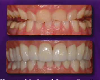
Chemical Induced Severe Erosion