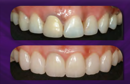
6-11 Ceramic Veneers - 8 Sub-Crown